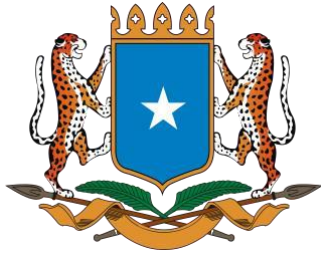
FEDERAL GOVERNMENT OF SOMALIA